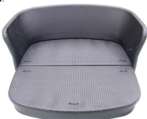
Shown without cushions installed.

CAUTION: DO NOT LIFT FURNITURE BY OR REMOVE THE BLACK STRAPS. THESE ARE USED FOR CUSHION CONNECTION!